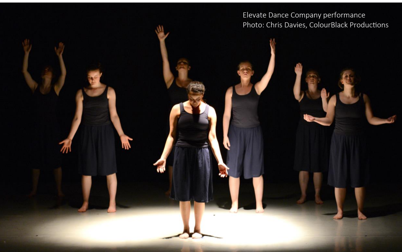
Elevate Dance Company performance

As a result of their experience on the course, graduates from Elevate are now enjoying successful and dynamic careers, undertaking further study, or simply enjoying bringing dance and faith together in their lives and communities.