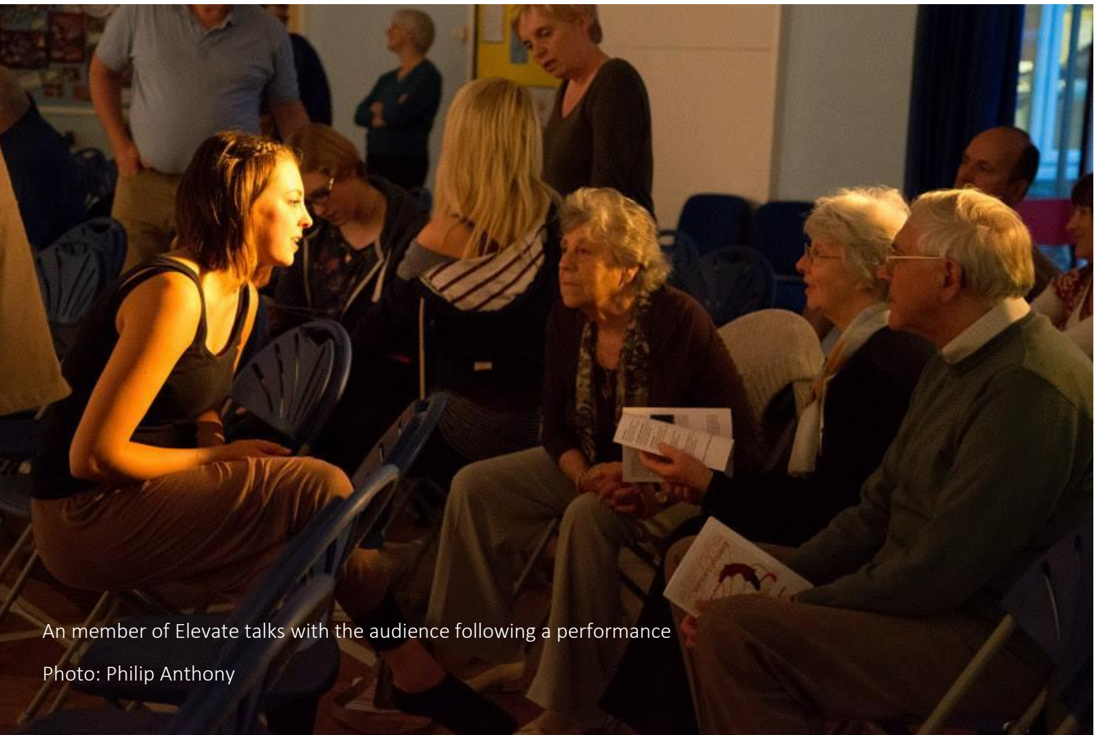
An member of Elevate talks with the audience following a performance

That depends on you! Each year, the majority of the Elevate Dance Company tour is hosted by venues known to course members. Family, friends, churches and schools local to students are usually keen to host a performance, workshop or residency. This is a wonderful way to give back to the communities that may well have supported you through your training. Tour venues include churches, schools, festivals and youth/after school clubs. Previous students have toured to America, Canada, New Zealand, Austria, and Italy as well as across the UK and London.