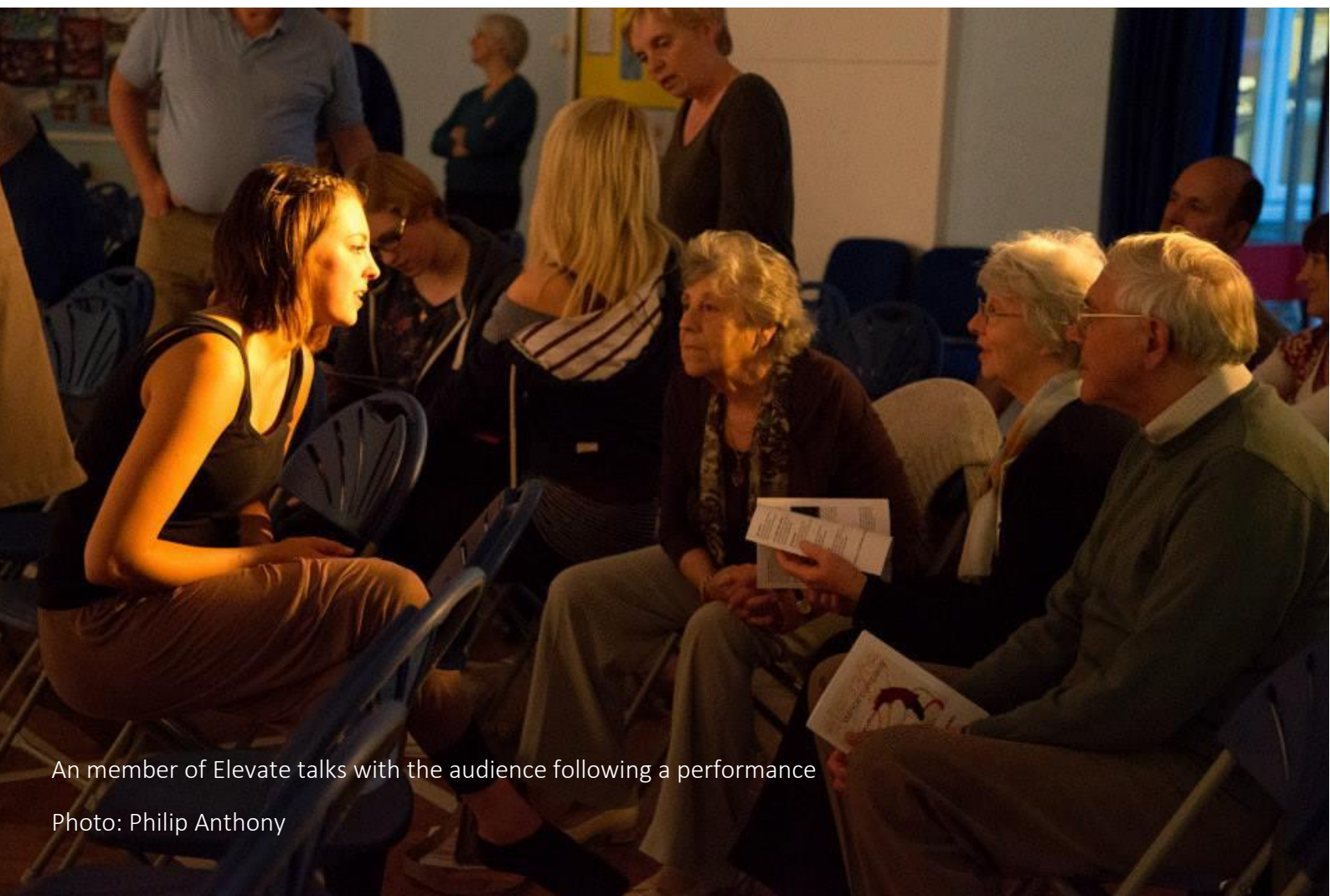
An member of Elevate talks with the audience following a performance

That depends on you! Each year, the majority of the Elevate Dance Company tour is hosted by venues known to course members. Family, friends, churches and schools local to students are usually keen to host a performance, workshop or residency. This is a wonderful way to give back to the communities that may well have supported you through your training. Tour venues include churches, schools, festivals and youth/after school clubs. Previous students have toured to America, Canada, New Zealand, Austria, and Italy as well as across the UK and London.