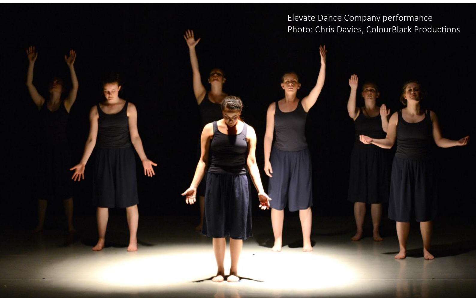
Elevate Dance Company performance

As a result of their experience on the course, graduates from Elevate are now enjoying successful and dynamic careers, undertaking further study, or simply enjoying bringing dance and faith together in their lives and communities.